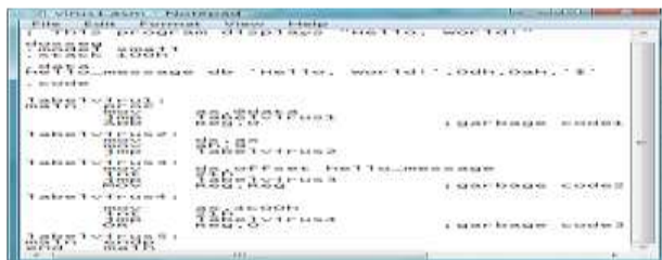
Figure 1: Assembly code of Virus File

The mutating behaviour of metamorphic viruses is due to their adoption of code obfuscation techniques like dead code insertion, Variable Renaming, Break and join transformation. Figure 1 shows the assembly file of the virus code. Computer viruses like polymorphic viruses and metamorphic viruses use more efficient techniques for their evolution so it is required to use strong models for understanding their evolution and then apply detection followed by the process of removal. Code Emulation is one of the strongest ways to analyze computer viruses but the anti-emulation activities made by virus designers are also active [4] [5] [6] [7] [8].